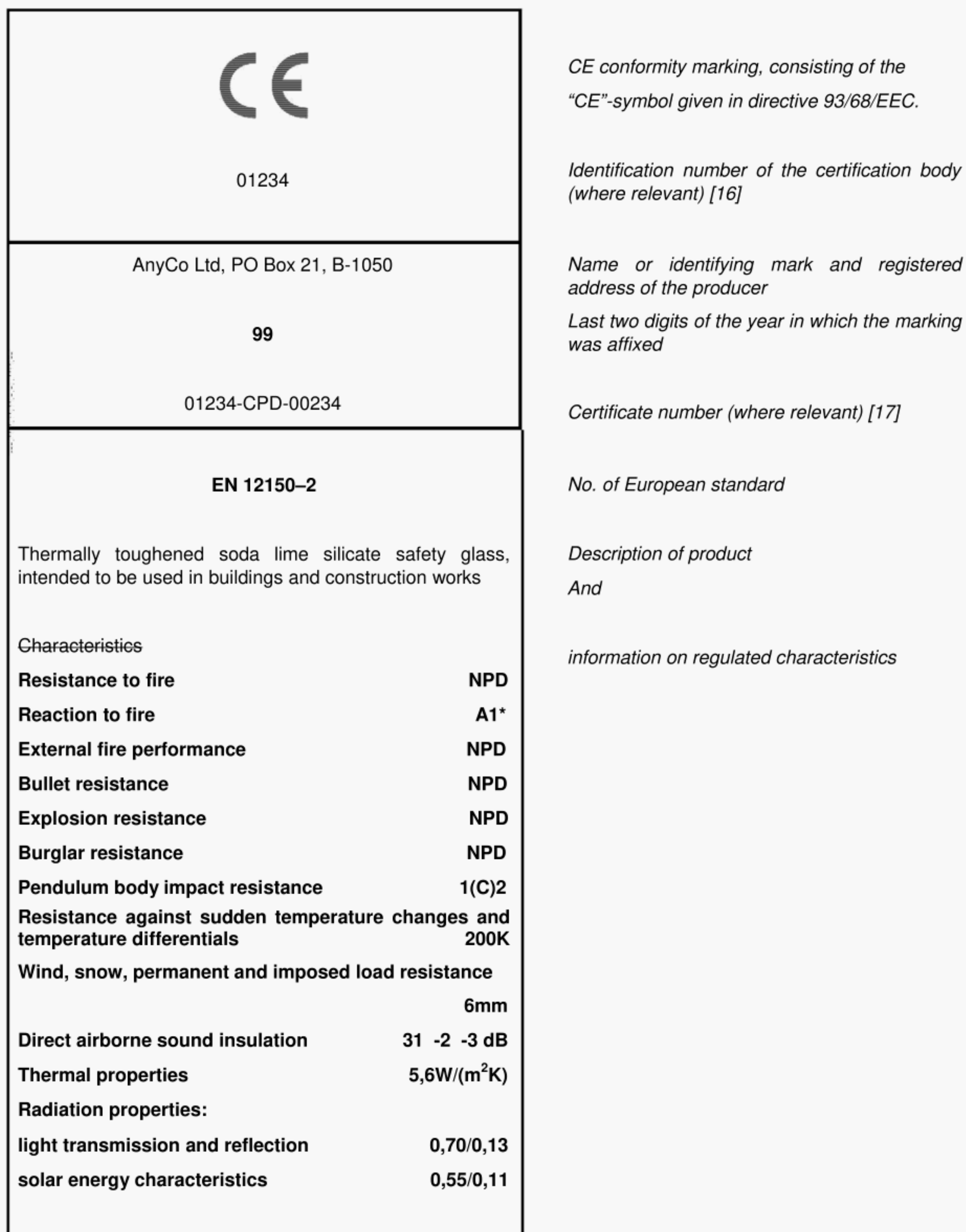
Figure ZA.1 - Example CE marking information for system of attestation 1